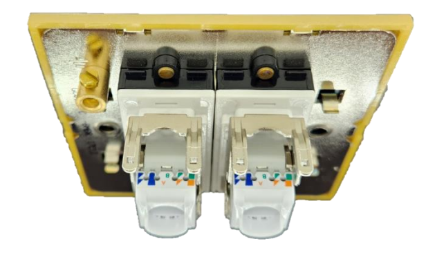
Product view from Top